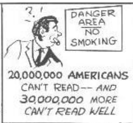
20,000,000 AMERICANS CAN'T READ -- AND 30,000,000 MORE CAN'T READ WELL