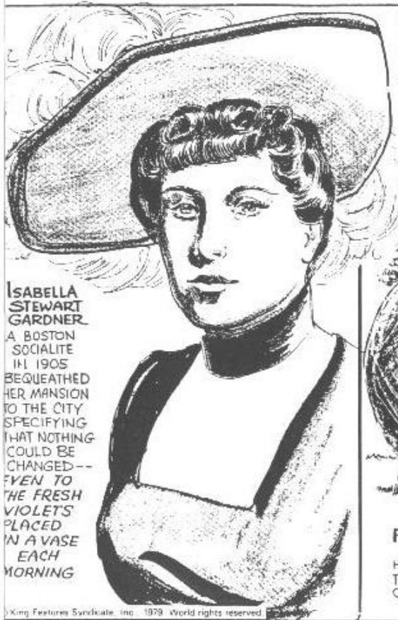
ISABELLA STEWART GARDNER A BOSTON SOCIALITE IN 1905 BEQUEATHED HER MANSION TO THE CITY SPECIFYING THAT NOTHING COULD BE CHANGED -- EVEN TO THE FRESH VIOLETS PLACED IN A VASE EACH MORNING